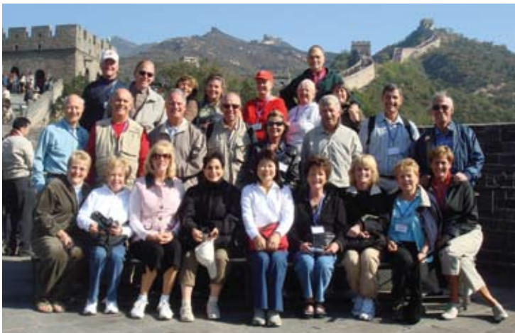
The group on the Great Wall