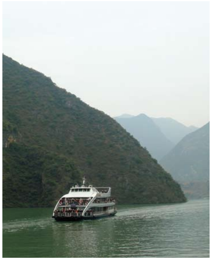
A ferry at Three Gorges in the Yangtze River

For Chinese Christians, the holidays do not end on January 1. Rather, it kicks off celebrations in anticipation of the Chinese New Year. The coming year will be the Year of the Rat. ●